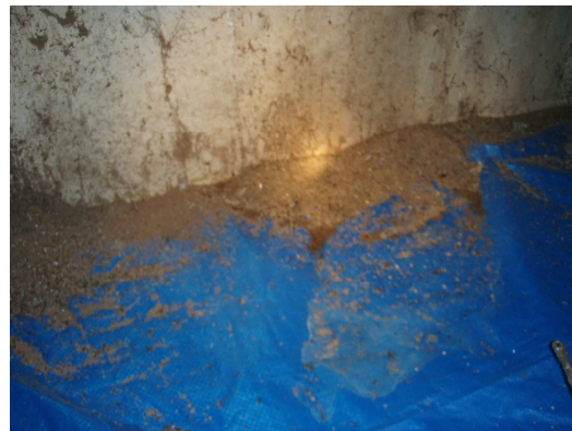
Carpenter ant frass at crawl space.