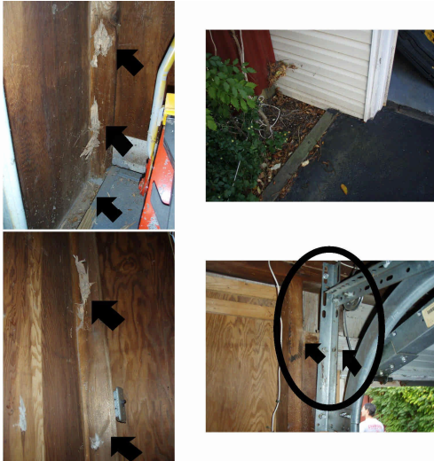
Garage termite damage examples.