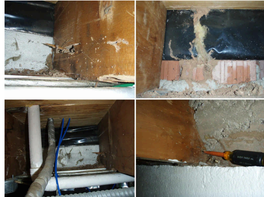
Basement termite damage examples.