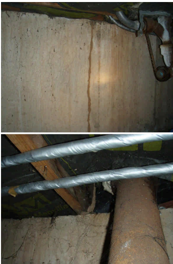
Crawl space termite damage/mud tunnels.